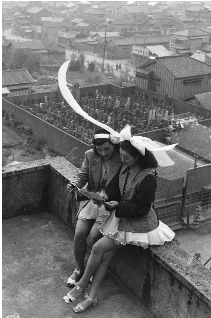
Dancers resting on the rooftop of the SKD Theatre. Asakusa, Tokyo